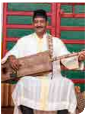
Presented with the generous support of the "OCP Group" and the "Moroccan Embassy-Canberra".